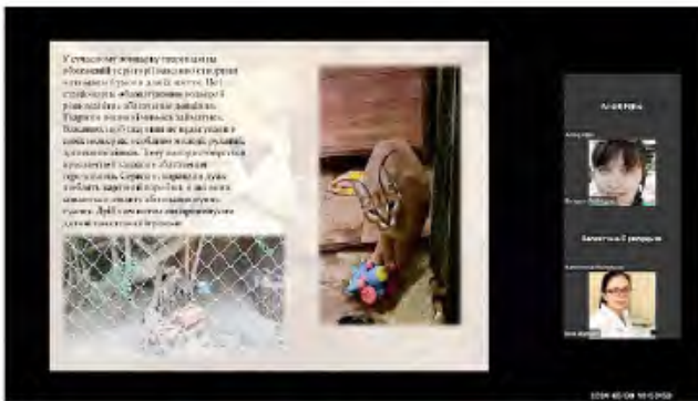
Онлайн семінар Утримання котятчих