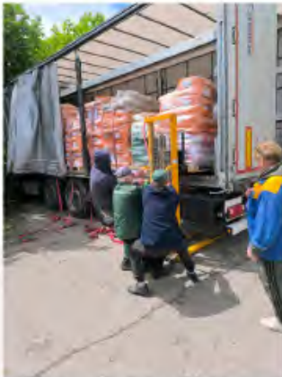
Assistance from EAZA member zoos