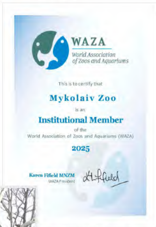
Миколаївський зоопарк отримав сертифікат WAZA 2025, який підтверджує членство в цій асоціації