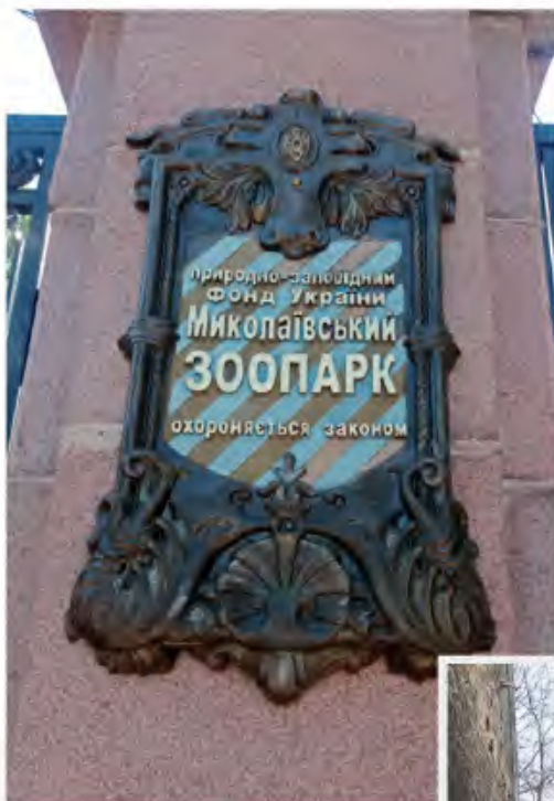
Знак об'єкту природно-заповідного фонду загальнодержавного значення

Підводячи підсумки, можна сказати, що незважаючи на війну протягом 2024 року було виконано необхідно-можливий обсяг робіт у всіх сферах діяльності зоопарку.