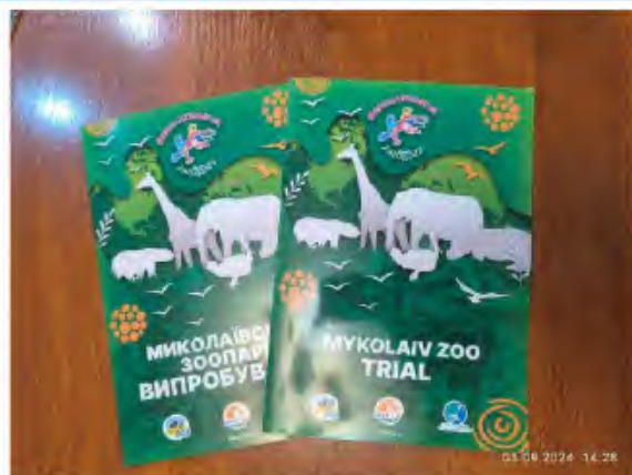
Вийшла нова брошура Миколаївський зоопарк - випробування

У вересні 2024 року було видано нову брошуру «Миколаївський зоопарк. Випробування», в якій йдеться про досвід роботи зоопарку в період повномасштабного вторгнення російської федерації. У тяжкий воєнний час Миколаївський зоопарк продовжує співпрацювати з міжнародною зоопарківською спільнотою, у тому числі з Всесвітньою асоціацією зоопарків і акваріумів (WAZA), куди наш зоопарк, єдиний із зоопарків України, був прийнятий у 2003 році. Завдяки співробітництву з подібними організаціями, ми