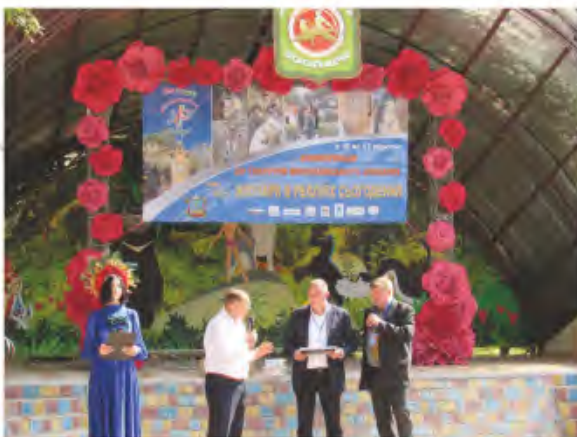
Opening of the conference at the zoo

From August 16 to December 27, 2019, an initial certification of working conditions for 83 workplaces of animal care workers in zoological departments was carried out to determine the right to benefits and compensation for work with harmful and difficult working conditions. The researches were conducted by the sanitary laboratory of the Mykolaiv branch of the State Enterprise "Black Sea Expert Technical Center of the State Labor Service" and the southern regional sanitary laboratory for labor protection and certification of workplaces at the expense of the zoo's own funds in the amount of 44,220 UAH. Based on the results of the initial certification of workplaces and in accordance with