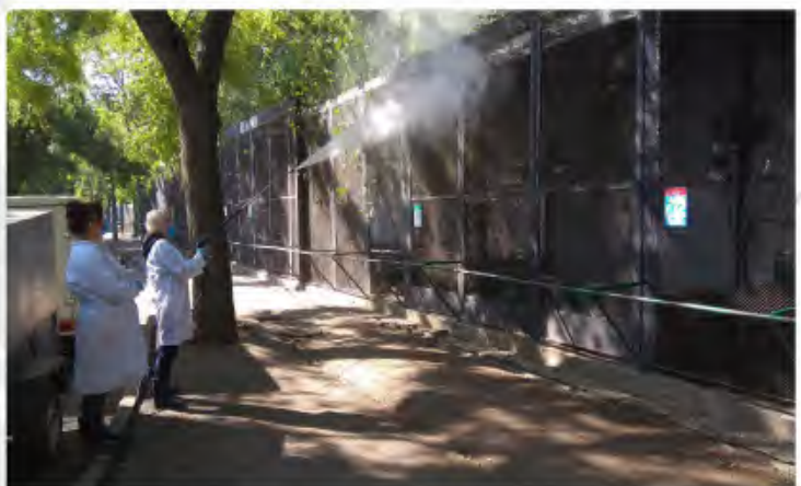
Disinfection of aviaries during avian flu quarantine

On December 5, 2024, the issue of canceling the quarantine for bird flu was considered at an unscheduled meeting of the State Anti-Epizootic Commission and quarantine restrictions in Mykolaiv Zoo were canceled. The ornithology department became available for observing.