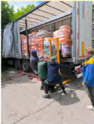
Допомога від зоопарків членів ЄАЗА

ради IV, VI, VIII скликань, засновника зоопарківського музею, директора, автора багатьох книжок про зоопарк, поета з ювілеєм.