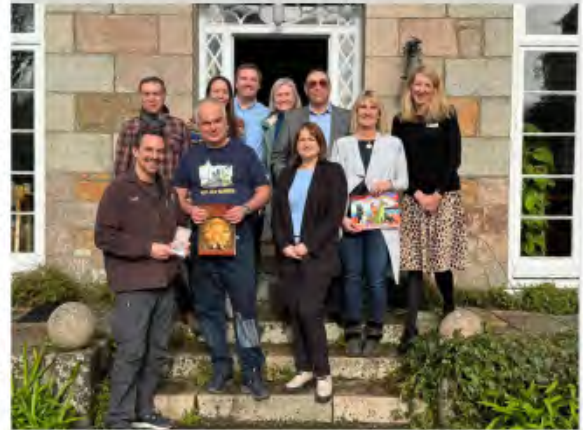
Visits by AZU leaders to zoos in Great Britain