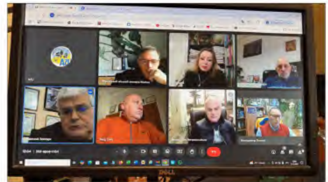
Онлайн наради керівників АЗУ