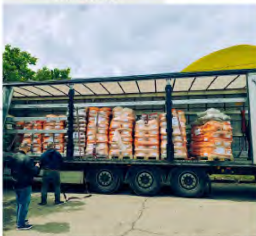
Допомога сублімованими кормами від зоопарків членів ЄАЗА

Ми дякуємо Європейській асоціації зоопарків та акваріумів (ЄАЗА) за організацію збору коштів, придбання сублімованих кормів для тварин та організацію їх доставки до Миколаївського зоопарку. Корми, отримані Миколаївським зоопарком, вкрай важливі та необхідні тваринам установи. До складу зоопарку було розвантажено 11,5 тон різних кормів на суму 17870,79 євро. Це корми для фламінго, папуг, страусів, рогатих воронів, слонів, жирафів, кенгуру, зебр, травоядних, овець, черепах, ставкових риб, мишей та щурів. Ця допомога є фактом підтвердження співдружності зоопарків. Машина з подібним набором кормів вирушила з Миколаєва до Харківського зоопарку. Миколаївський зоопарк вдячний Міфанві Гріффіт, виконавчому директору ЄАЗА, та Ейпріл Адамс, директору з розвитку членів ЄАЗА, і всім, хто пожертвував гроші для придбання цих кормів.