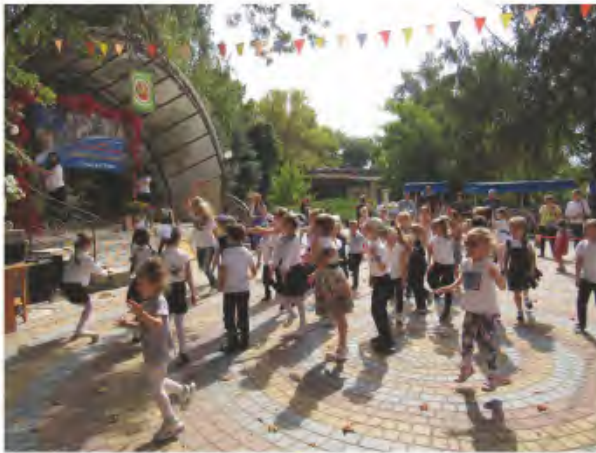
Grand opening of the conference at the zoo