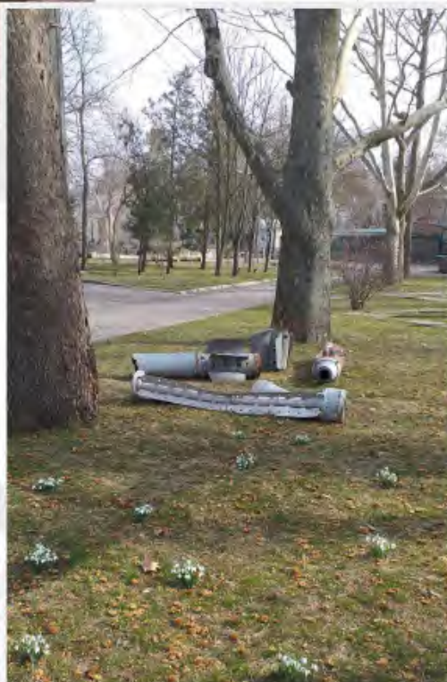
Війна триває, але життя перемагає