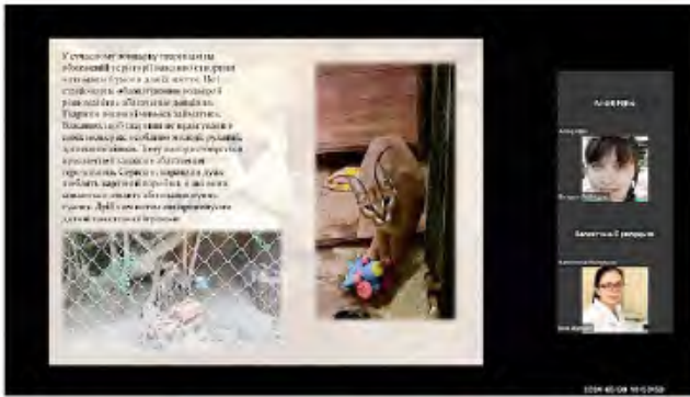
Online seminar Felines Keeping