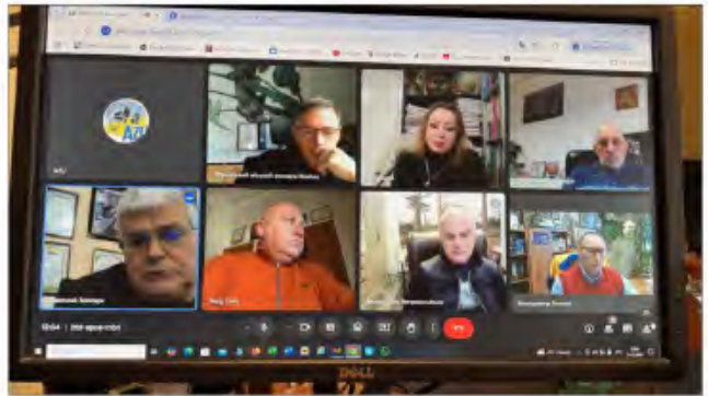
Online meetings of AZU leaders