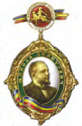
Order of Leontovych