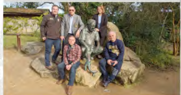
Visit by AZU Heads to Jersey Zoo