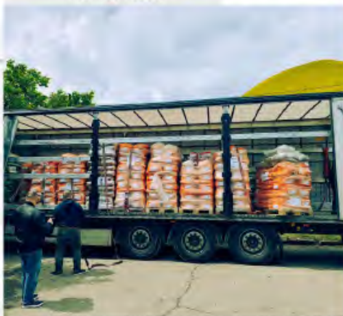
Freeze-dried food assistance from EAZA member zoos