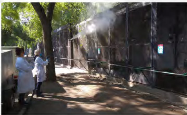
Дезинфекція вольєрів під час карантину на пташиний грип

18 вересня 2024 року територія КУ Миколаївський зоопарк була