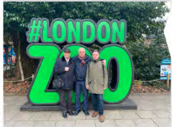
Visit by AZU leaders to London Zoo