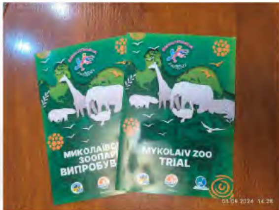
A new brochure has been released Mykolaiv Zoo Trial

On September 18, 2024, the territory of Mykolaiv Zoo was declared unfavorable for bird flu and quarantine was introduced due to the detection